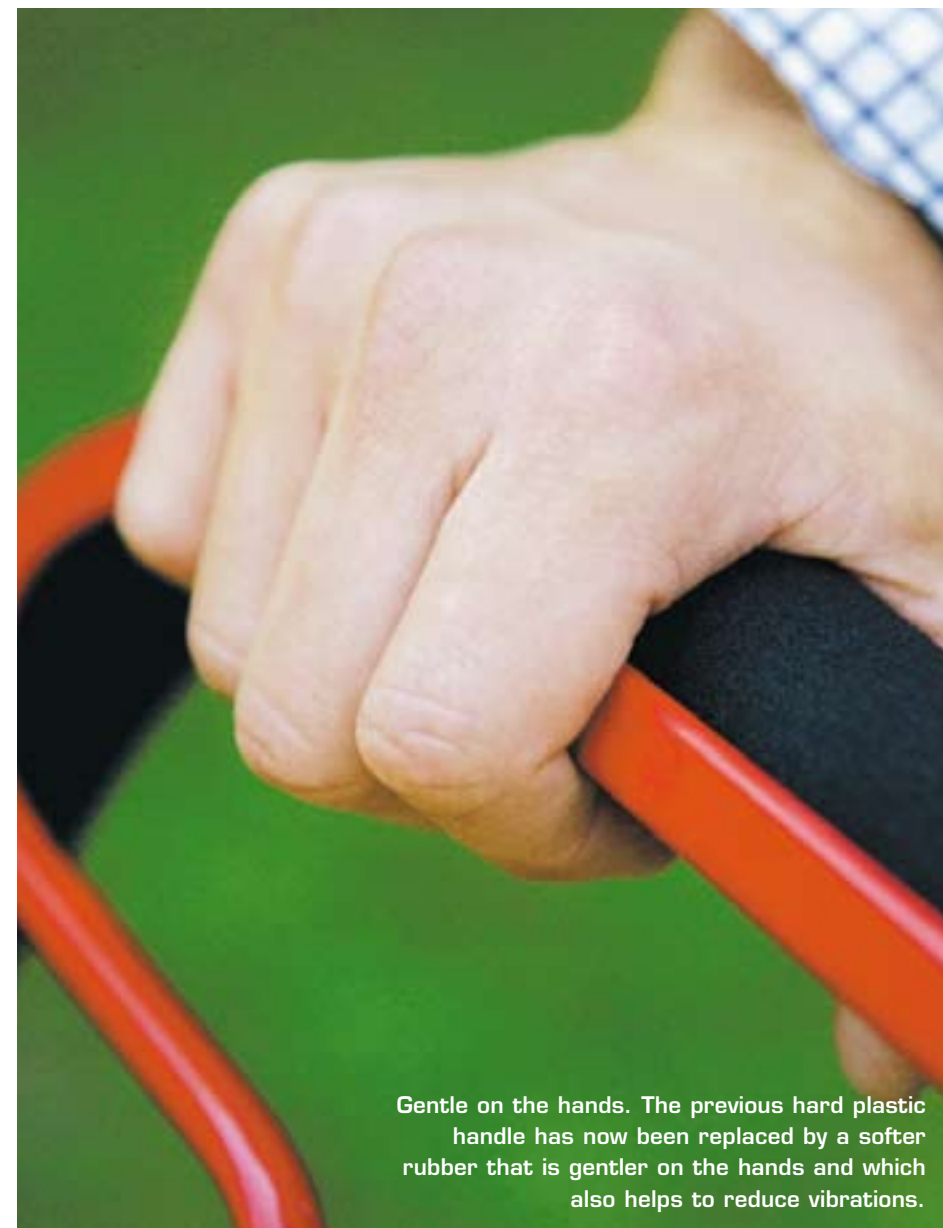
Gentle on the hands. The previous hard plastic handle has now been replaced by a softer rubber that is gentler on the hands and which also helps to reduce vibrations.