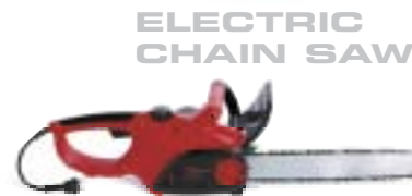
ELECTRIC CHAIN SAW