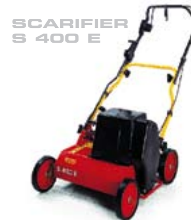
SCARIFIER S 400 E