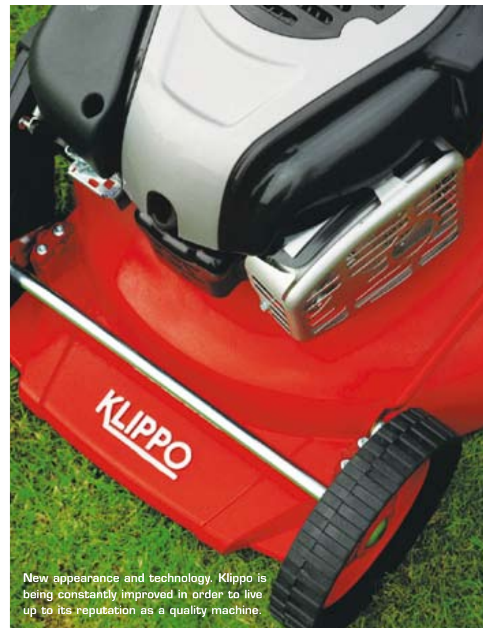
New appearance and technology. Klippo is being constantly improved in order to live up to its reputation as a quality machine.

Some improvements here, some there – Klippo never stands still – even when it comes to developing new ideas to make lawnmowing more effective and hassle-free.