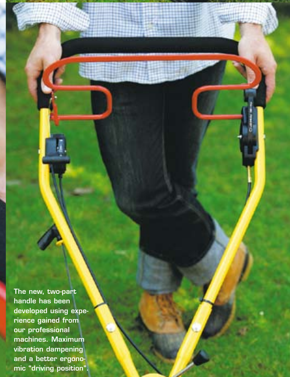
The new, two-part handle has been developed using experience gained from our professional machines. Maximum vibration dampening and a better ergonomic "driving position".