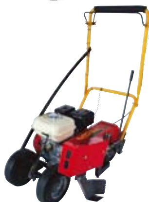
EDGE DRESSER PRO E 400