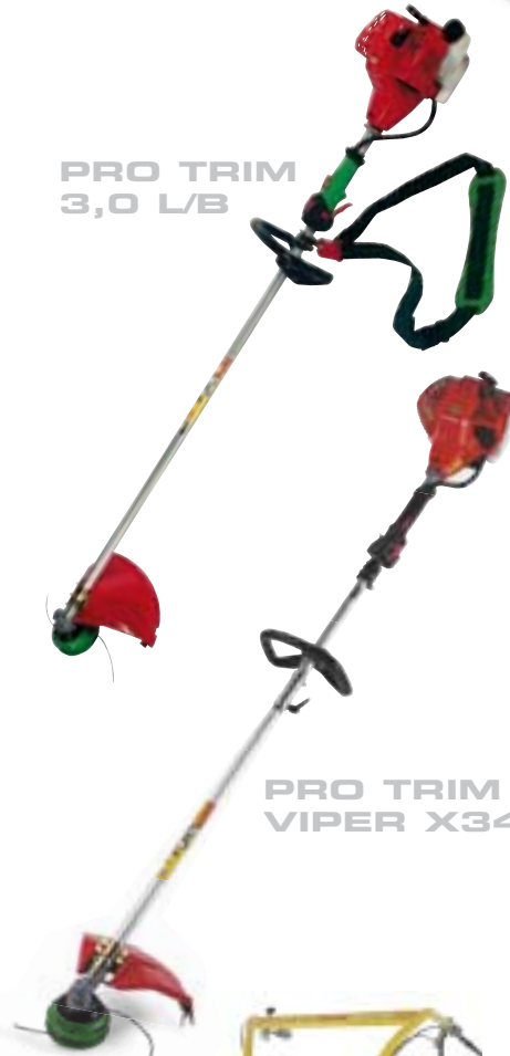
PRO TRIM VIPER X34