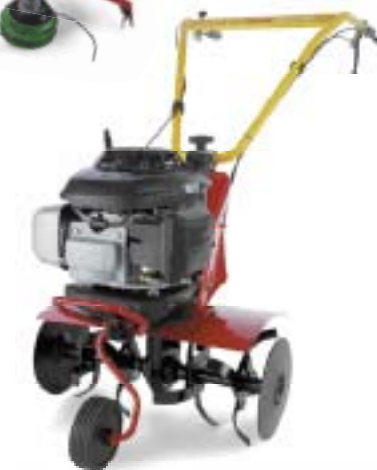
CULTIVATOR PS 045H